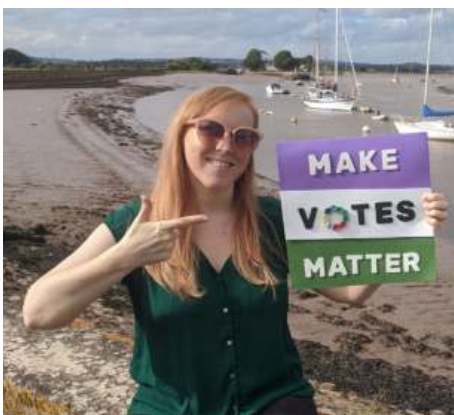
Your Green Councillors want your vote to matter.