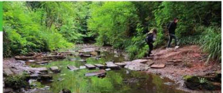
The Northbrook stream crossing has been well used by residents for decades.

Catherine added, "We are also exploring ways to partner with other local groups to make the crossing more accessible should it be reopened."